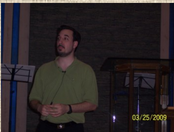
Me ministering at Spirit of Faith Church in Dimapur, Nagaland, India.