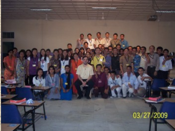
The students and I in the Bible school. See more pics here ->