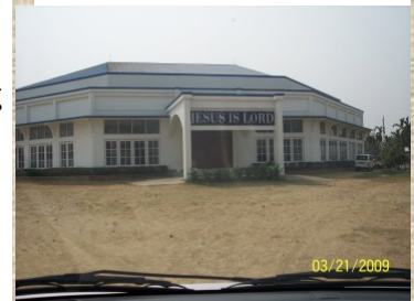
Spirit of Faith Church Dimapur, Nagaland. See more pics here ->

Unfortunately, I did not need to get up early because the flight was delayed by two hours. That began the worst experience of my entire life!